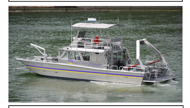
R/V Riggs, ECU Research vessel steaming along.