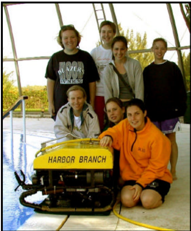
Hood College group with ROV at Harbor Branch Oceanic Institute, Fort Pierce, FL.